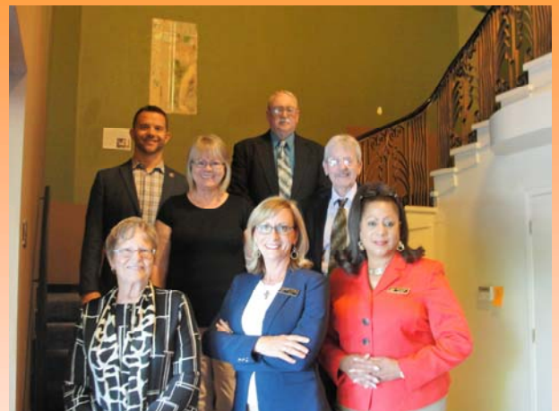
Oroville City Council