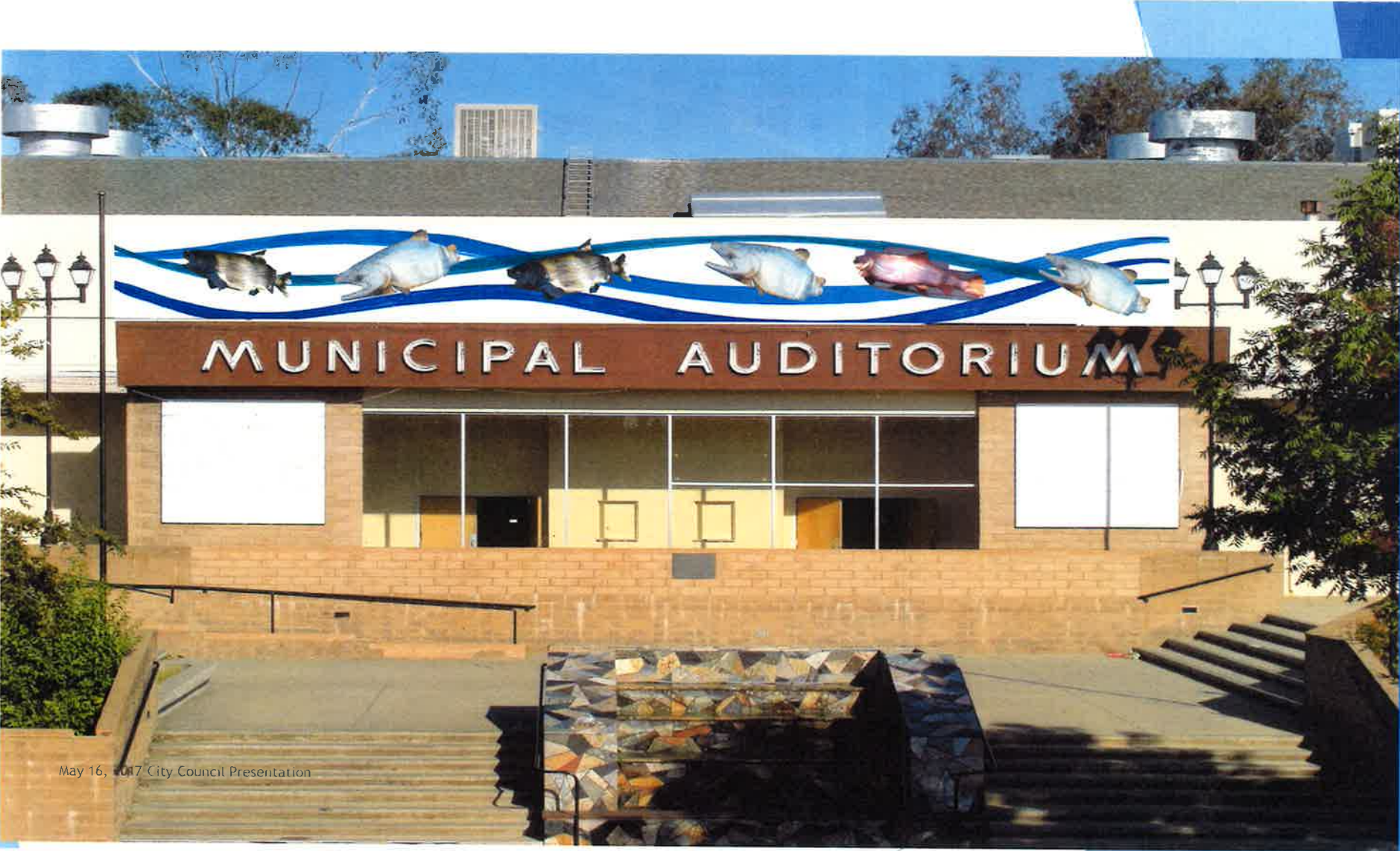
May 16, 2017 City Council Presentation